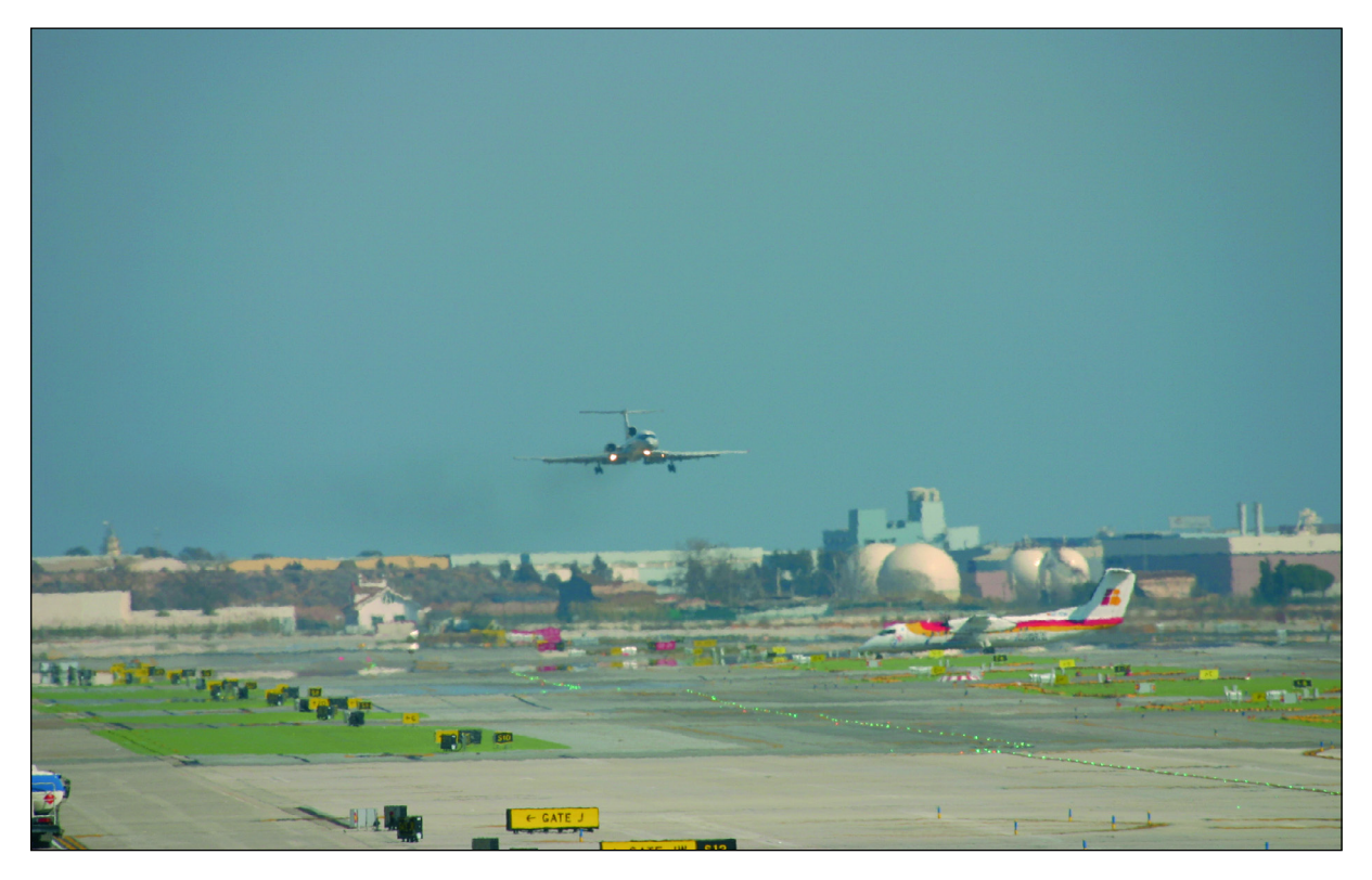
Photo 1. Aircraft approaching to taxiway T at the time a Dash-8 is leaving the taxiway T