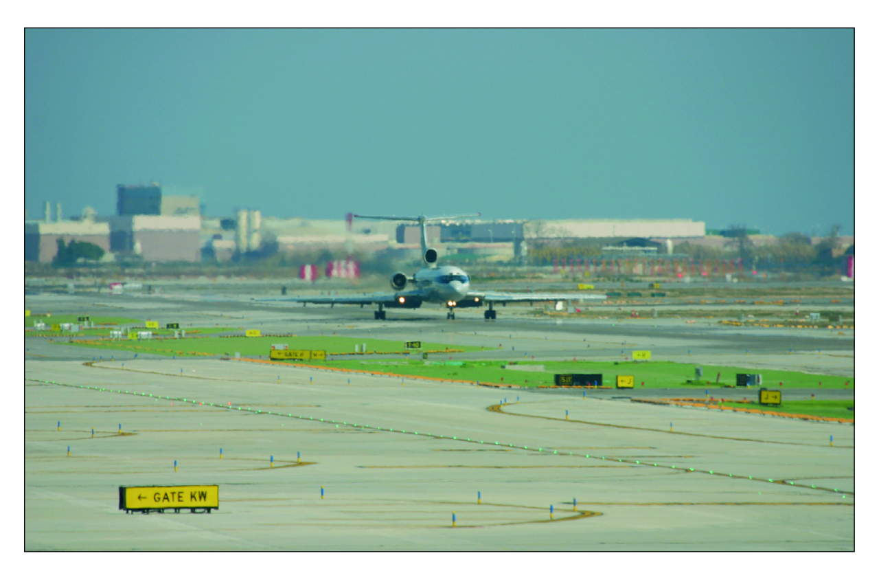
Photo 2. Aircraft landing on taxiway T