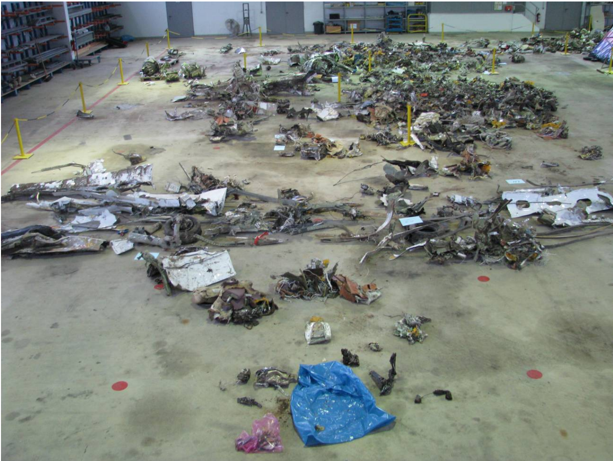
Wreckage parts in the BFU hangar