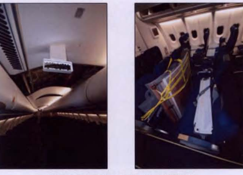
Figure 1: Internal damage to ZZ333.

1.3.27 There was no reported damage to the flight deck. During a postoccurrence review by Airbus, it was assessed that the forces placed upon the sidestick during the recovery from the incident were beyond its design specification; therefore, the side-stick was deemed unserviceable.